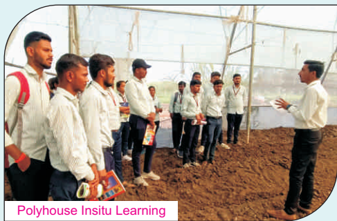
Polyhouse Insitu Learning