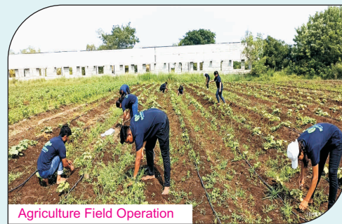
Agriculture Field Operation